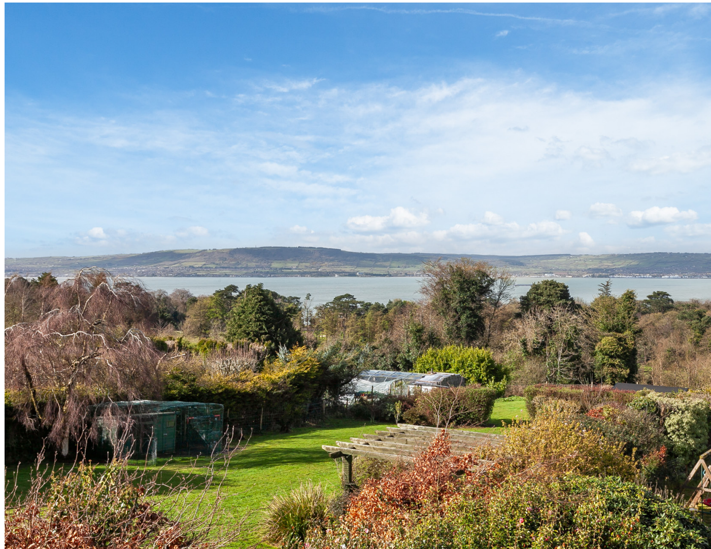
Lovely Lough views over rear garden