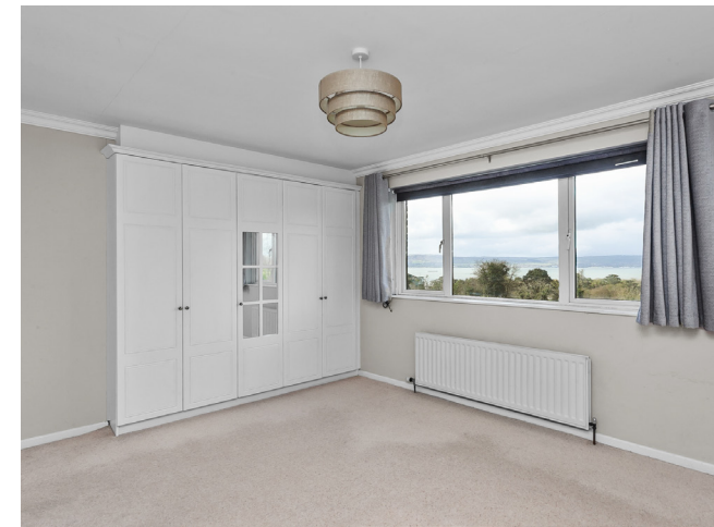
Bedroom 1 with built in robes and Lough views

Flagged patio. Water tap and outside light.