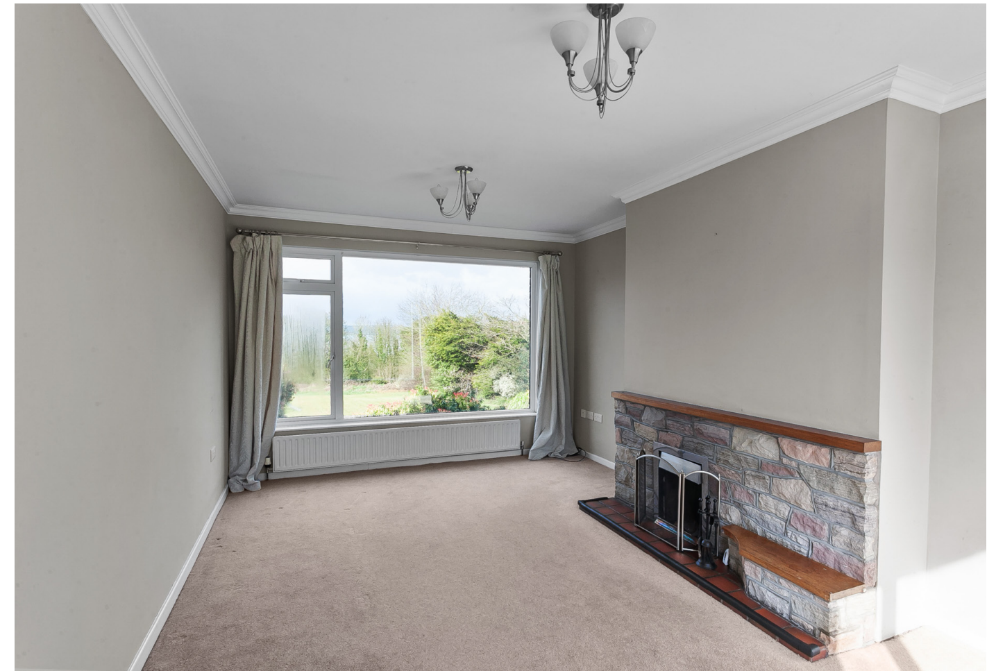
Bright living room with Lough views