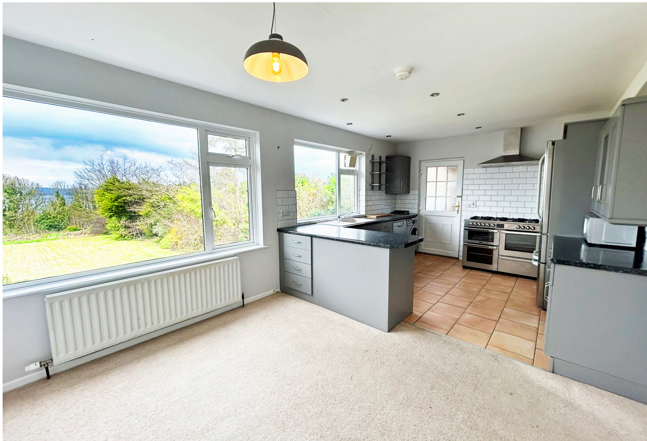
Dining kitchen with Lough views