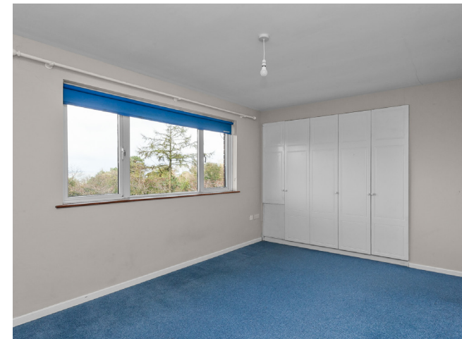
Bedroom 2 with built in robes and Lough views