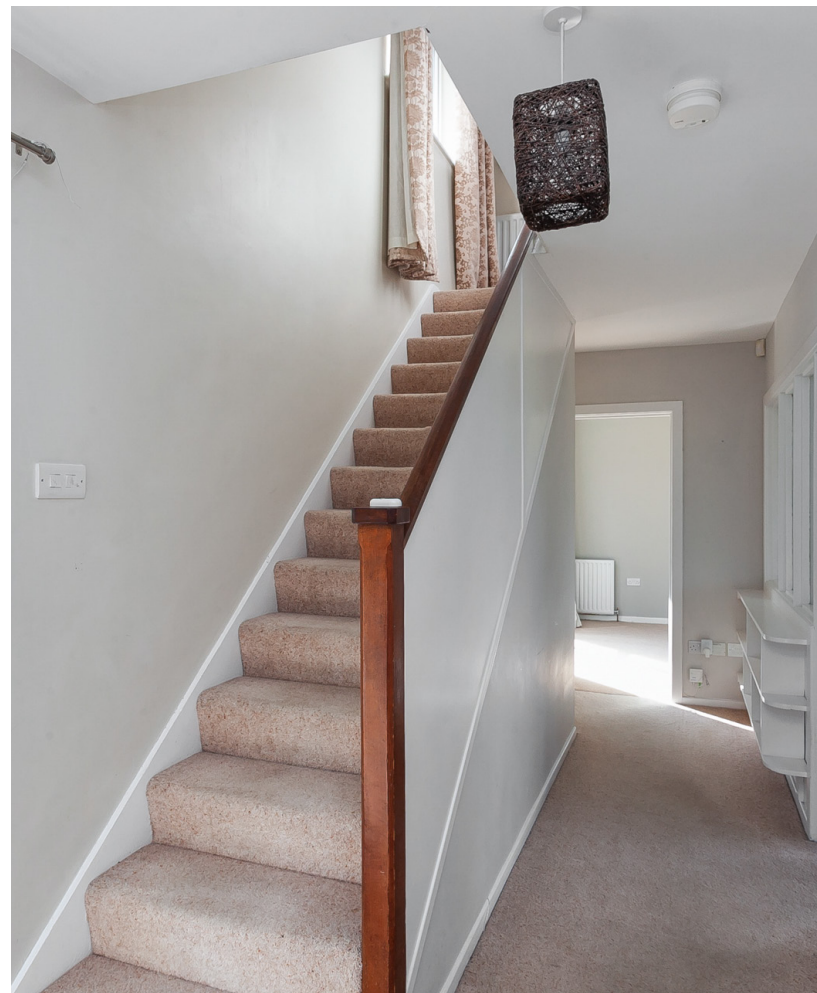
Part panelled staircase