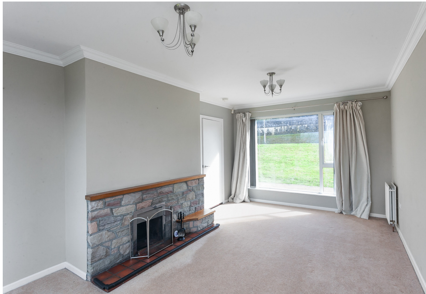
Bright living room