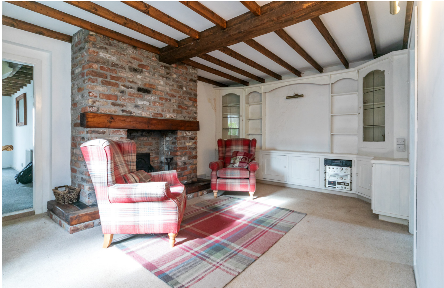
Living room with reclaimed brick fireplace and beamed ceiling

Flexible accommodation to suit personal needs c.1280 sq.ft.