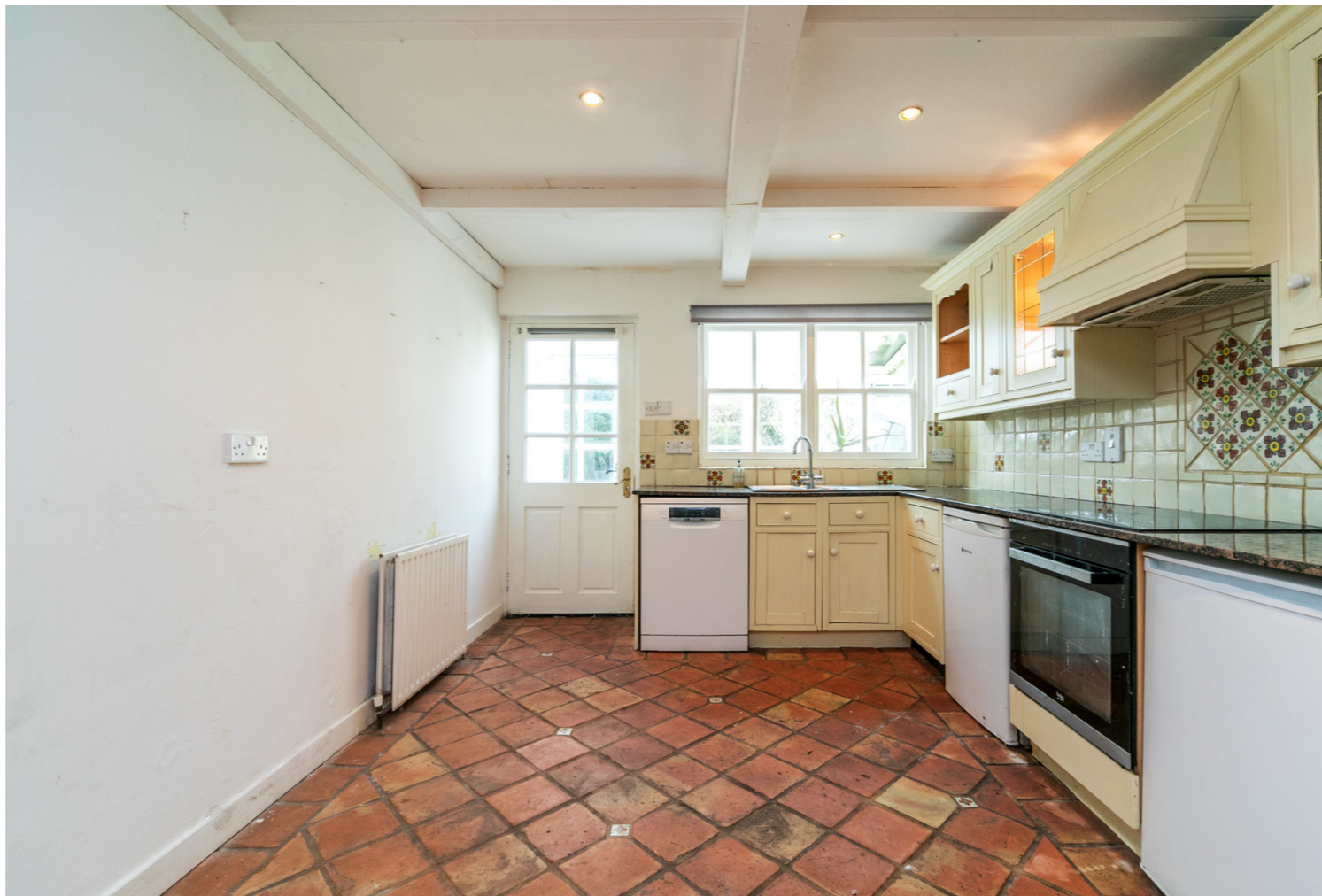
'Country kitchen' with space for breakfast table and chairs