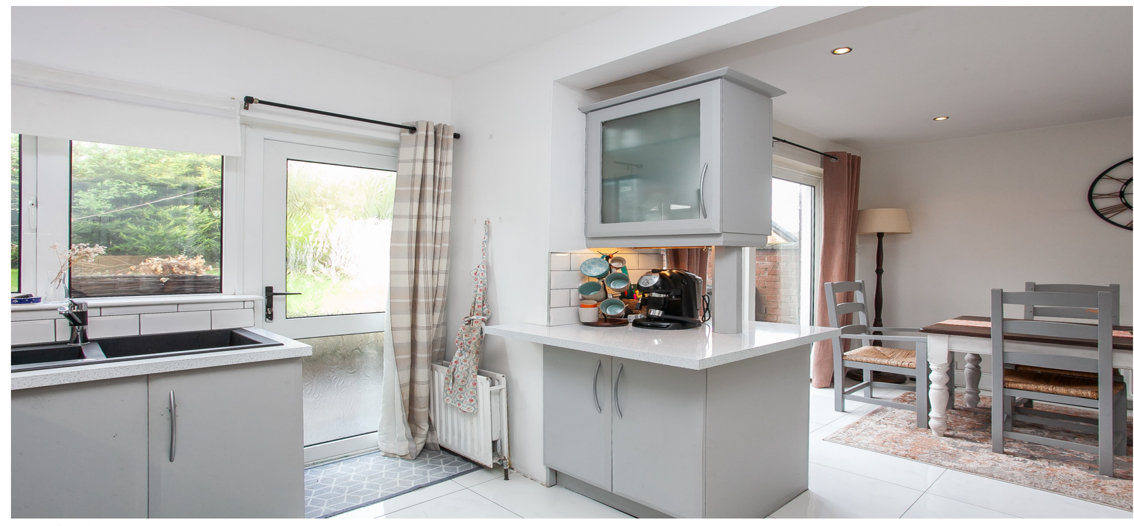
Kitchen with casual dining