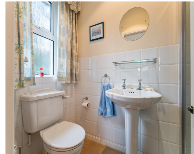
Ensuite shower room