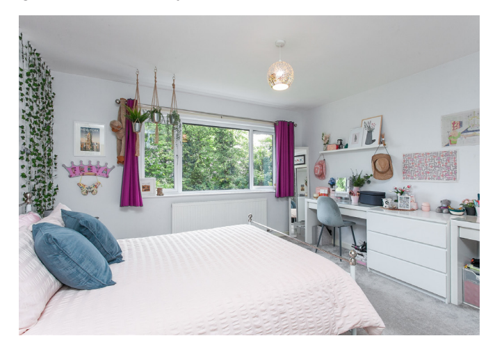
BEDROOM (3): 12' 10" x 11' 6" (3.91m x 3.51m) including double built in wardrobe with sliding mirror doors. View over rear garden to Irish Sea beyond.

BEDROOM (2): 13' 0" x 12' 6" (3.96m x 3.81m) Plus double built in wardrobe with sliding mirror doors. View over rear garden to Irish Sea beyond.