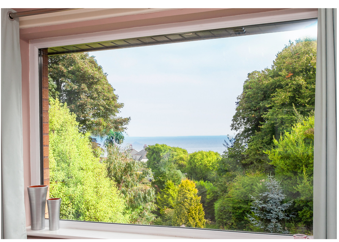
Beautiful setting with views of Irish Sea beyond