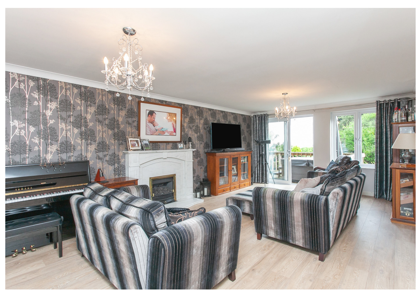
Drawing room with marble fireplace leading to deck with hot tub