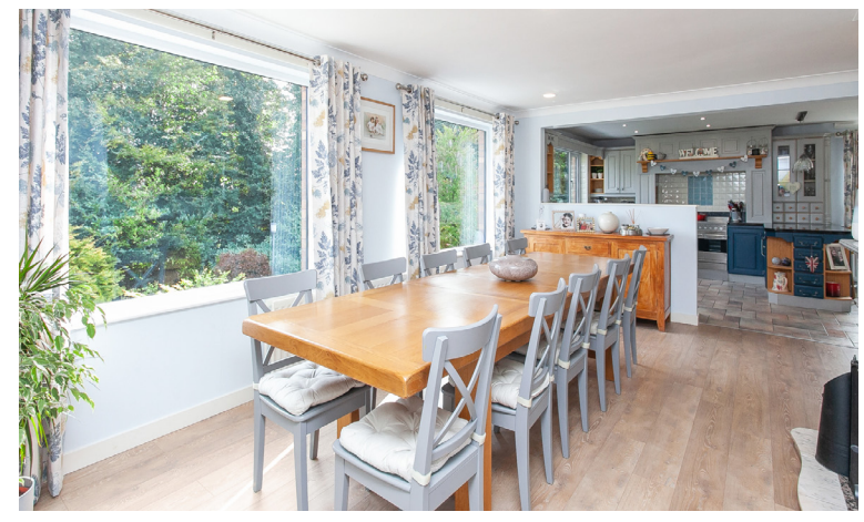
Space for dining overlooking garden with sea views beyond