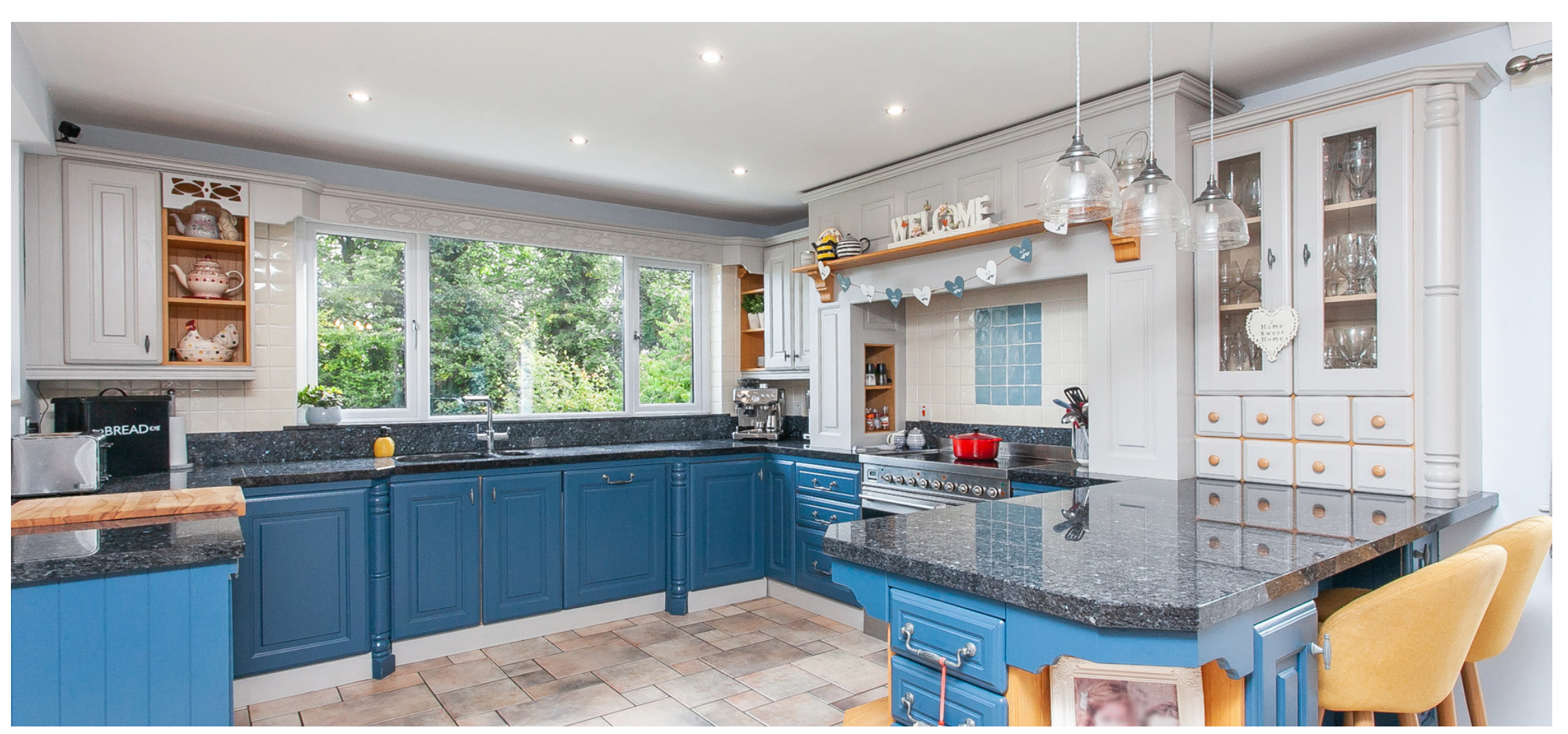
Fitted and equipped kitchen with polished granite worktops