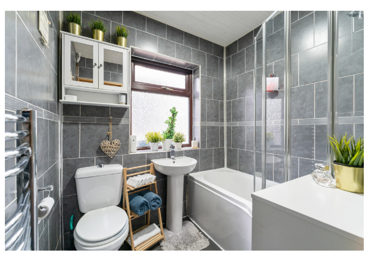
Ground floor bathroom