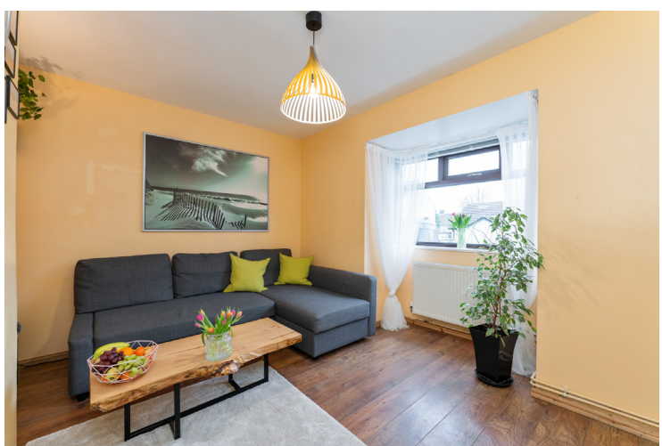
Comfortable living room