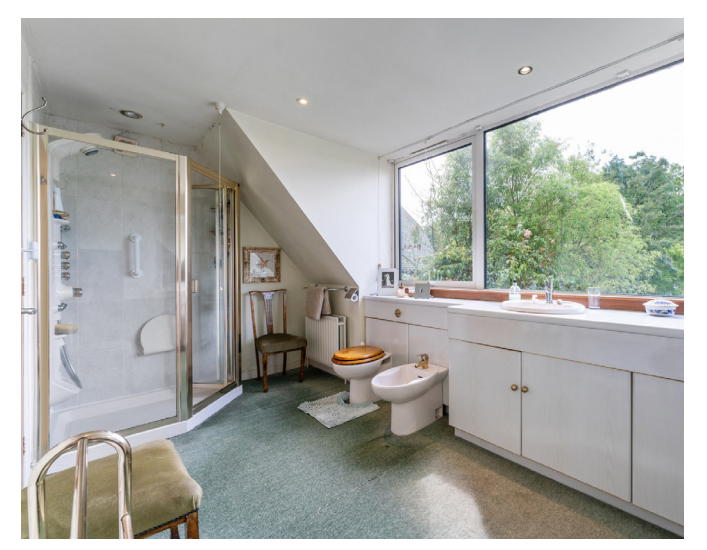
Ensuite shower room

Front garden laid in lawns with mature borders, lawns and a tarmac driveway with parking for three cars.