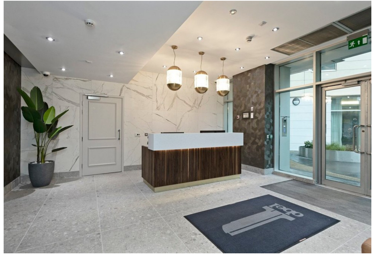
Communal entrance hall