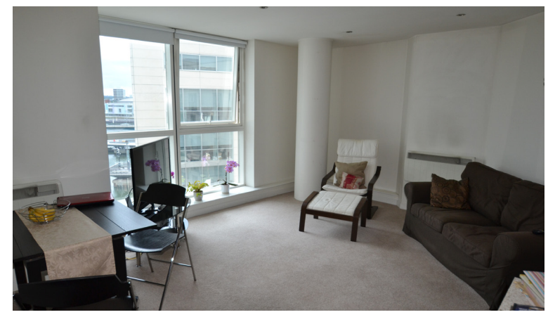
Living room open to kitchen